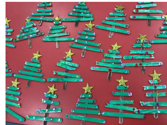
Eaglets have been busy this week with Christmas Art week, they have enjoyed making Christmas cards and Christmas trees.