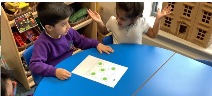
Chicks have been working hard counting and sharing amounts.