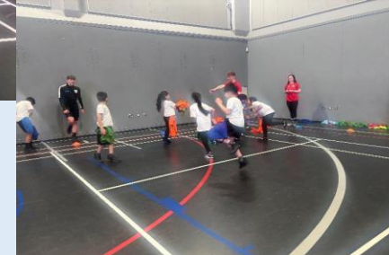
Year 3 and 4 Multi Sports