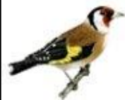
2 - Goldfinches

Robins have had another fabulous week. We had an amazing start to the week with our colour run. It was great fun. The children also had a brilliant time with UV sports in the sports hall. In English, we have continued our work on Peter Rabbit and the children have completed their own independent Peter Rabbit stories. Everyone did their very best.