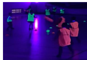
Colour run fun!