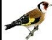
2 – Goldfinches

Robins have had another great week. The children enjoyed a lovely winter walk as part of our science topic. We had a fabulous workshop learning all about Guy Fawkes and his attempt to blow up the Houses of Parliament. In English we have been innovating our 'Supertato' story using a new 'super veggie'. Well done Robins, another great week!