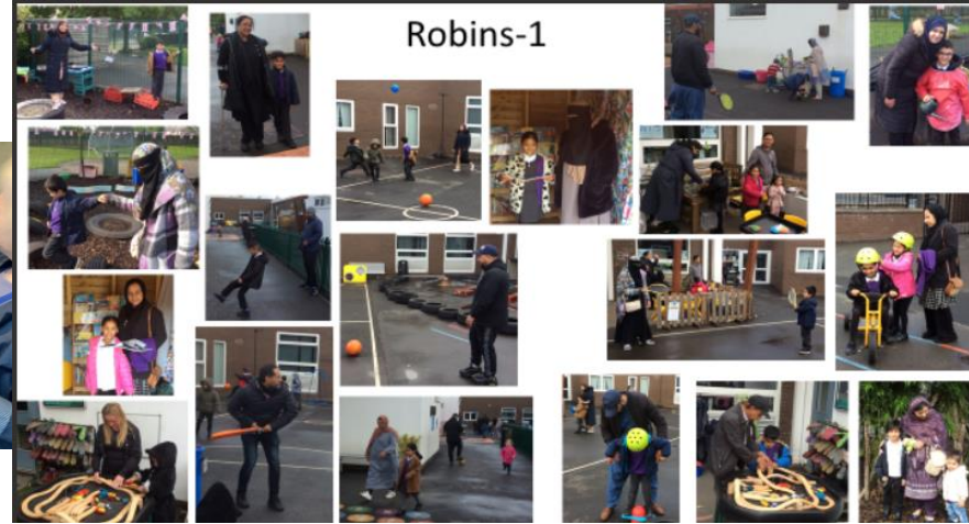
Thursday 22 nd May 2025 LC: Can we observe and record information in our local area?