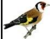
2 – Goldfinches

Wow!!! It might be the last week of term but we have not stopped our learning. We have been writing letters to the children at Longton Primary School which we will continue to be linked with when we move into Year 1. We have looked at the Mona Lisa by Leonardo De Vinci and tried to recreate his famous painting ourselves! We have made cards to say thank you to our year 6 buddies! Well done Owlets what a wonderful class you have been.