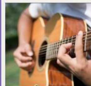
INTERMEDIATE GUITAR ENSEMBLE 5:20-5:50PM | MR WEBB