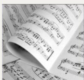
MUSIC THEORY | 4:20-4:50PM MRS SPALL